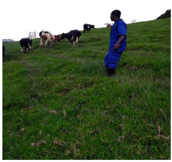
Figure 3: TVET Animal Health teacher

TVET teacher with grazing cattle, Muhanga District