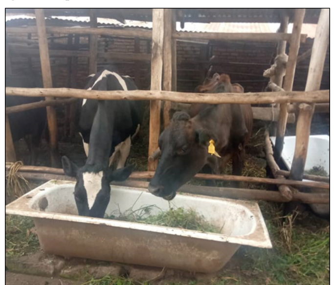
Figure 1: Imported-breed cattle, Musanze District

Cattle breeds reared in Rwanda can be divided into three categories: Indigenous, imported, and cross breeds. A study conducted in Nyagatare District, Eastern Province, found that 67.03% of cattle in the district were Indigenous breeds, 28.37% were cross breeds, and 4.6% were imported breeds (Mazimpaka, 2017).